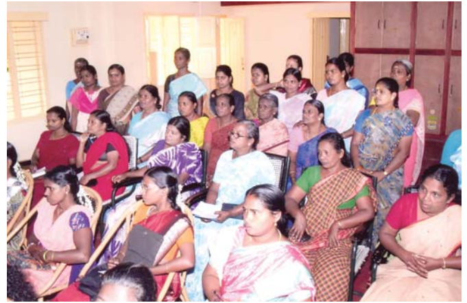
Women leaders from NCUI in briefing session

An entrepreneurship orientation programme for 19 women leaders from various SHGs of NCUI co-operative education field project, Thiruvananthapuram, Kerala was organized by WWF from 21 to 25 March 2009. The members were accompanied by a lady mobiliser and an instructor. The team was briefed on the activities of the Forum, visited a fish market and tsunami hit areas in Chennai followed by visit to other branches of WWF in Kanchipuram, Vellore, Adiramapattinam in the Tanjore coastal area and Dindigul. The team gained knowledge about the micro-credit programme and was exposed to various training methodologies at WWF. Direct interactions with the members of WWF were extremely useful and enabled the team to compare the quality of WWF's programmes with theirs. Suggestions were given to the participating team to select women from the grassroots and train them to take up leadership roles as a future course of action. The women self-