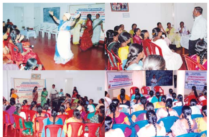
Role play and demo sessions

The programme focused on healthcare related issues such as reproductive healthcare, population stabilization and emphasized on decision making