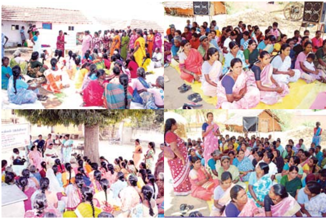
Members interaction at the workshops in Dindigul and Dharmapuri

In the Dindigul and Dharmapuri branches of Working Women's Forum (India), workshops were organized from 17 to 19 February and 2 to 5 April 2009 respectively. The President of WWF participated in all these workshops. The aim of these workshops was to create awareness on the pressing local issues and provide a way to solve them. The workshops further facilitated women to learn additional skills, earn more income and become part of the mainstream production process. The members took advantage of this meet and presented several petitions to the President regarding the local issues/problems faced by them and the same were presented to the concerned authorities and district Collectors of Dharmapuri/Dindigul. ■