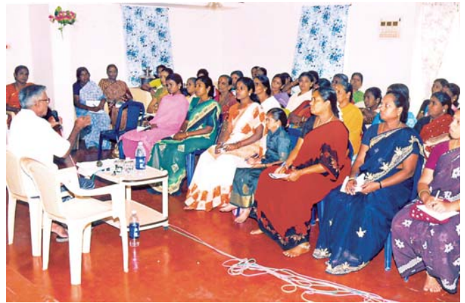
Participants at the orientation programme

Orientation programmes for field staff/trainers were organized from 9 to 13 February 2009 in Palakol (Andhra Pradesh), 23 to 27 February in Bangalore (Karnataka) and from 9 to 13 March 2009 in