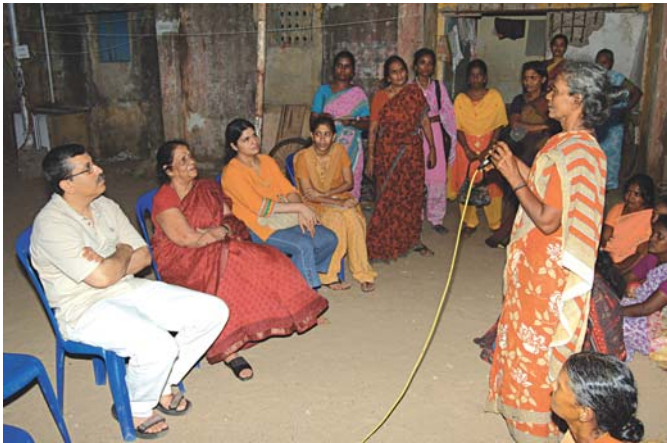
Member narrating her experience