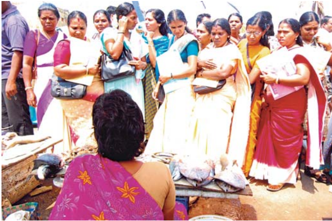
Thiruvananthapuram team interacting with the fisherwomen

An entrepreneurship orientation programme for 19 women leaders from various SHGs of NCUI co-operative education field project, Thiruvananthapuram, Kerala was organized by WWF from 21 to 25 March 2009. The members were accompanied by a lady mobiliser and an instructor. The team was briefed on the activities of the Forum, visited a fish market and tsunami hit areas in Chennai followed by visit to other branches of WWF in Kanchipuram, Vellore, Adiramapattinam in the Tanjore coastal area and Dindigul. The team gained knowledge about the micro-credit programme and was exposed to various training methodologies at WWF. Direct interactions with the members of WWF were extremely useful and enabled the team to compare the quality of WWF's programmes with theirs. Suggestions were given to the participating team to select women from the grassroots and train them to take up leadership roles as a future course of action. The women self-