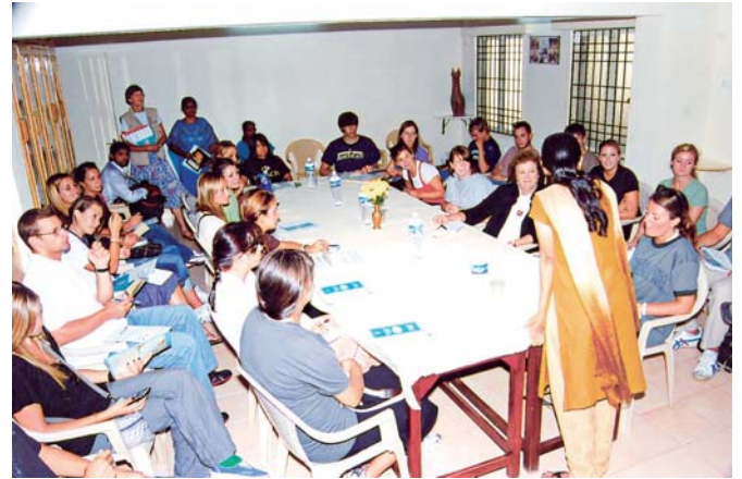
Students from Semester at Sea interacting with WWF staff

Similarly, 27 students from Semester at Sea from various Universities of U.S.A., visited WWF on 5 March 2009. The team from various disciplines and with varied interests were interested to know the programmes of the Forum, its origin, details of training including empowerment and skill training,