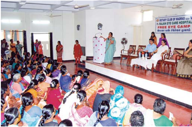
Inauguration of the eye camp

Working Women's Forum (India) in association with Rajan Eye Care Hospital organized a free eye camp for the grassroot women workers on 19 April 2009. Nearly 400 women participated in the event. In the welcome address the President, WWF emphasised the status of women's health. She highlighted the fact that women give high priority to their family and household responsibilities thereby neglecting their own health. Therefore, she pointed out that the Forum was committed in empowering women in extreme poverty by providing opportunities to help themselves through sound healthcare.